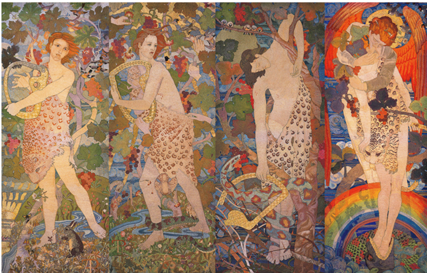
The Progress of a Soul / Phoebe Anna Traquair / 1895-1902

Scottish artist Phoebe Anna Traquair shared a similar enthusiasm for the richly gilded, intricate designs of medieval tapestry. In her hugely ambitious series of life-sized embroidered panels The Progress of a Soul , 1895-1902, which took her over seven years to complete, Traquair combines medieval embroidery techniques and styles with contemporary, secular subject matter, illustrating scenes based around the life of the character Denys L'Auxerrois, taken from popular English Victorian writer and critic Walter Pater's text Imaginary Portraits , published in 1887.