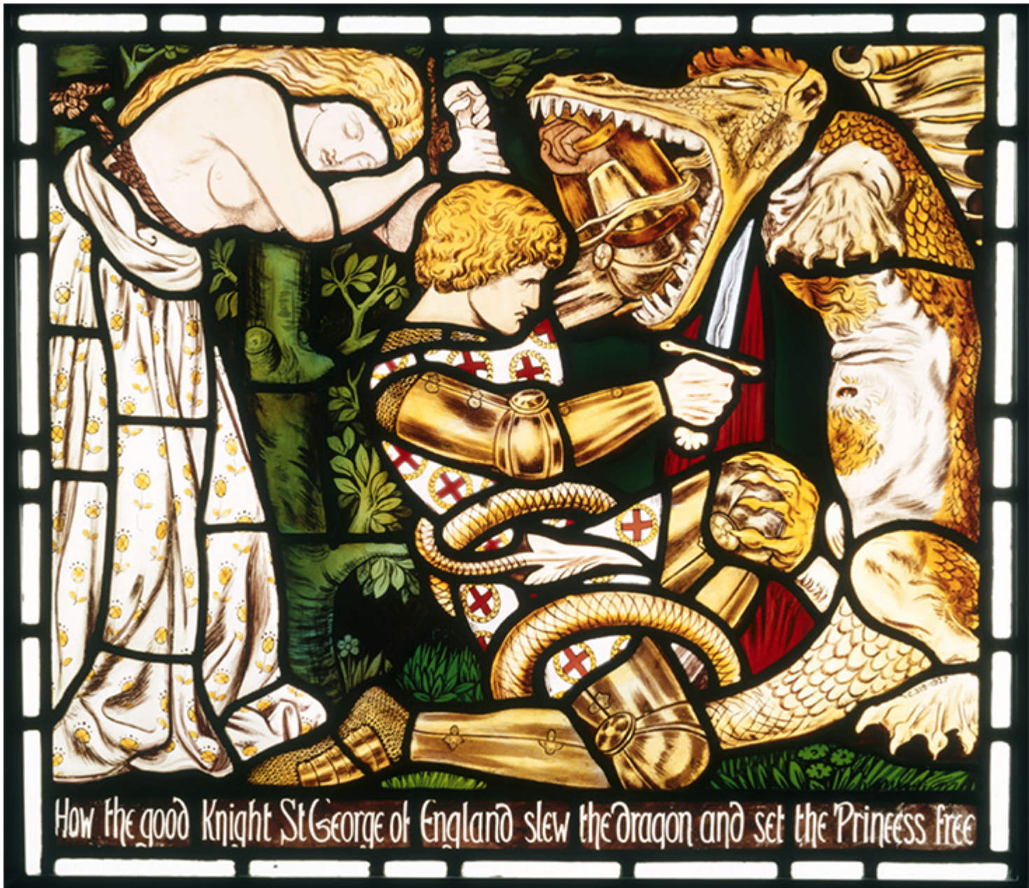
Legend of St George / William Morris and Dante Gabriel Rossetti / about 1862

After falling out of fashion for nearly two centuries, stained glass rose from the ashes during the Arts and Crafts era to become a widespread and mainstream form of decorative art. Its symbolic, religious associations and potential to create naturally lit colour made it an ideal form of expression for the new age. While Biblical subject matter was still popular, new 'glass artists' were careful not to simply paraphrase the art of the past. Many artists made their scenes more romanticised or idealised, giving them a nostalgic